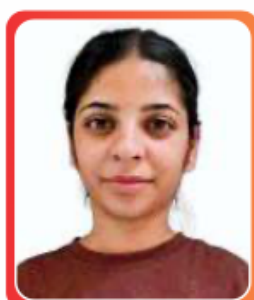
Rhythm BA - II 3 rd Individual in Group Shabad in Inter-Zonal