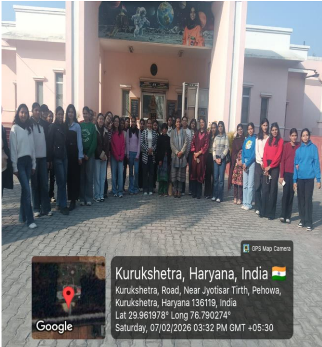
Kurukshetra, Haryana, India 🇮🇳 Kurukshetra, Road, Near Jyotisar Tirth, Pehowa, Kurukshetra, Haryana 136119, India Lat 29.961978° Long 76.790274° Saturday, 07/02/2026 03:32 PM GMT +05:30