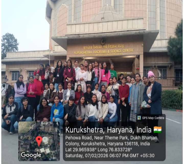
Kurukshetra, Haryana, India 🇮🇳 Pehowa Road, Near Theme Park, Dukh Bhanjan Colony, Kurukshetra, Haryana 136118, India Lat 29.965938° Long 76.833728° Saturday, 07/02/2026 06:07 PM GMT +05:30