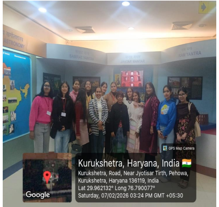
Kurukshetra, Haryana, India 🇮🇳 Kurukshetra, Road, Near Jyotisar Tirth, Pehowa, Kurukshetra, Haryana 136119, India Lat 29.962132° Long 76.790077° Saturday, 07/02/2026 03:24 PM GMT +05:30