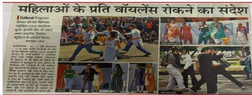
One Billion Rising held on 29th February 2024