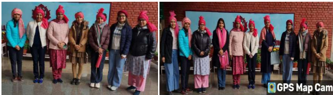
Girl Child day