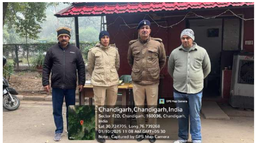
Police Patrol Vehicle deployed outside the main gate of the college for security