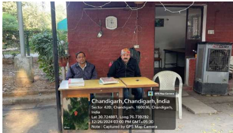
Security Guards 24x7 on the gate and in college campus