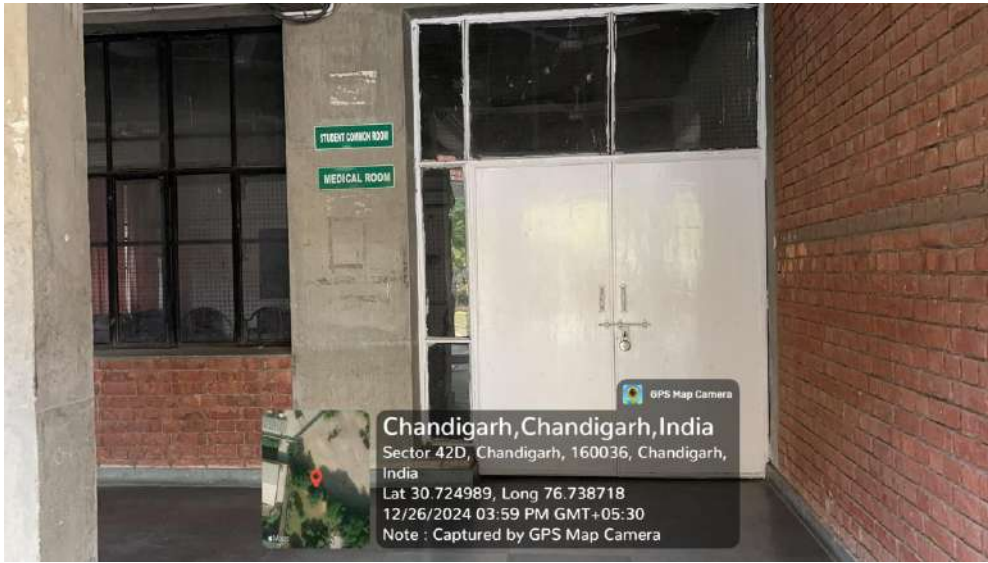
Common Room & Medical Room