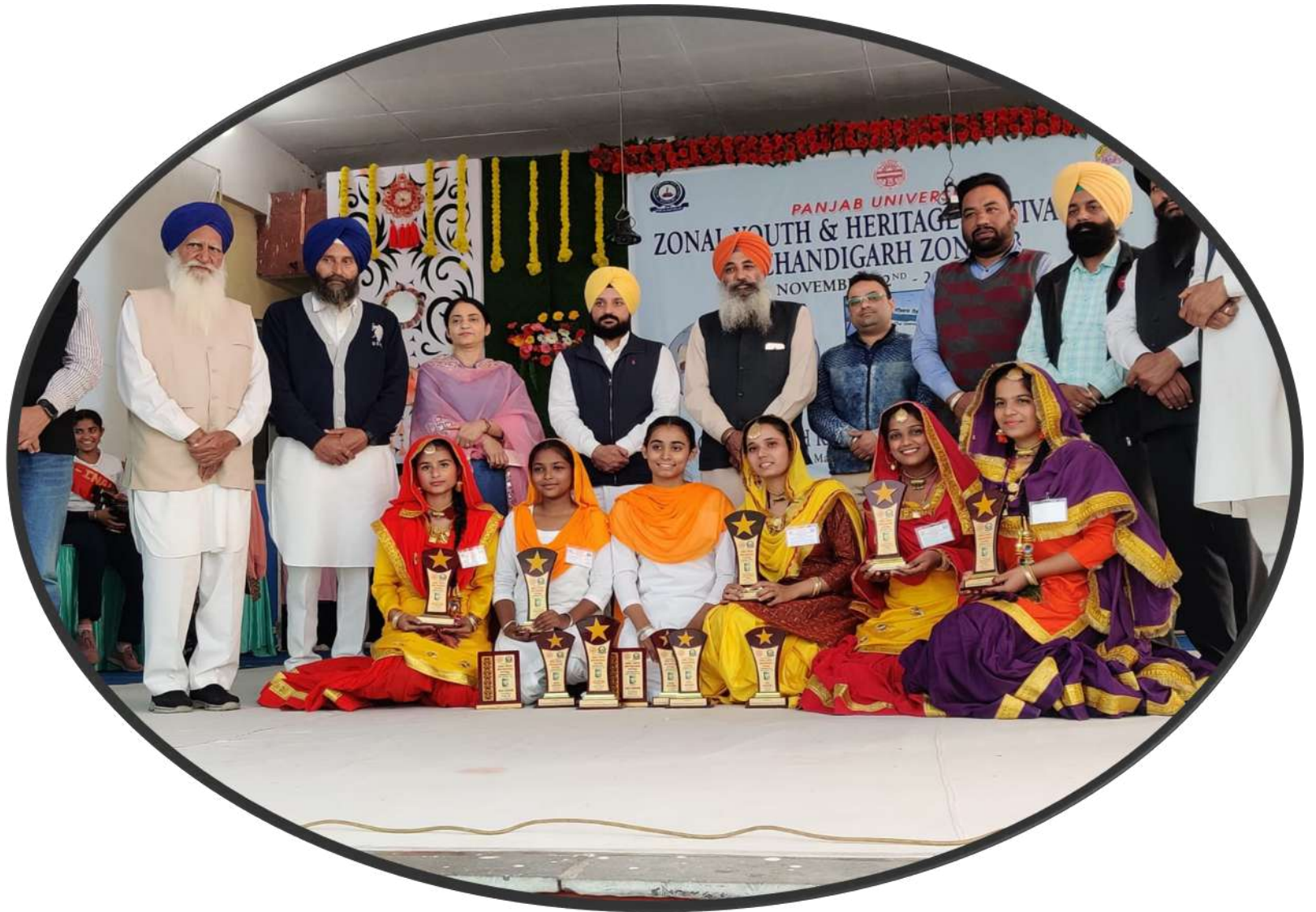
Prize Winner In Cultural Activities