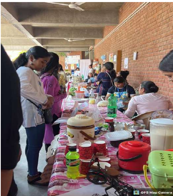
GPS Map Camera Chandigarh, CH, India Sector 42D, Chandigarh, 160036, CH, India Lat 30.725118, Long 76.738532 03/10/2023 12:36 PM GMT+05:30 Note : Captured by GPS Map Camera