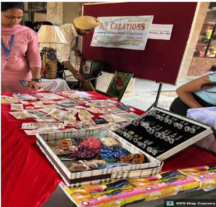
GPS Map Camera Chandigarh, CH, India Sector 42D, Chandigarh, 160036, CH, India Lat 30.725353, Long 76.738452 03/10/2023 12:35 PM GMT+05:30 Note : Captured by GPS Map Camera