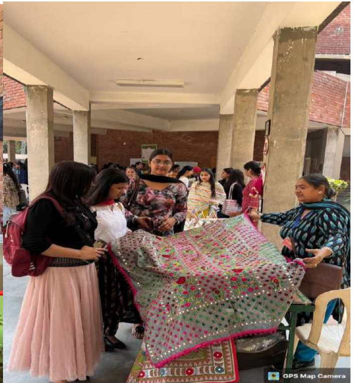
GPS Map Camera Chandigarh, CH, India Sector 42D, Chandigarh, 160036, CH, India Lat 30.724952, Long 76.738553 03/10/2023 12:37 PM GMT+05:30 Note : Captured by GPS Map Camera