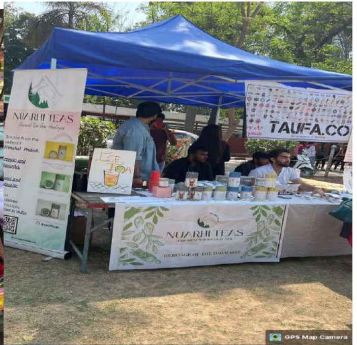
GPS Map Camera Chandigarh, CH, India Sector 42D, Chandigarh, 160036, CH, India Lat 30.724882, Long 76.738744 03/10/2023 12:38 PM GMT+05:30 Note : Captured by GPS Map Camera